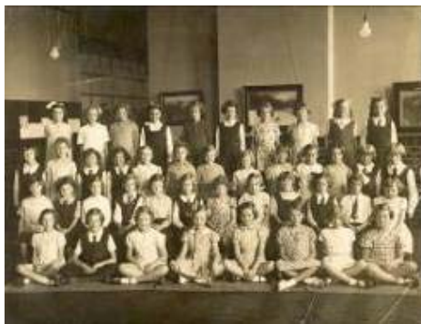
LEEWW : 2003.2442.2.7 Class at St George's Road Primary School, Wallasey, 1939 or 1940, prior to evacuation.