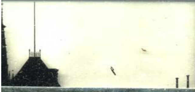
LEEWW : 2005.2933 V1 flying bomb falling on London

As part of the preparations for war the Government planned to move most children away from dangerous cities to safe areas in the country, where they would stay with local people. The main evacuation started on the 1 st of September 1939, two days before Britain declared war on Germany. Children had to assemble at school with their gas mask and a spare set of clothes. Many families were split apart as young children were sent to places of safety.